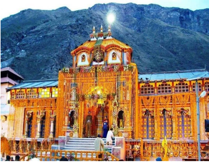
Badrinath Ji Temple