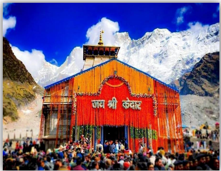
Kedarnath Ji Temple